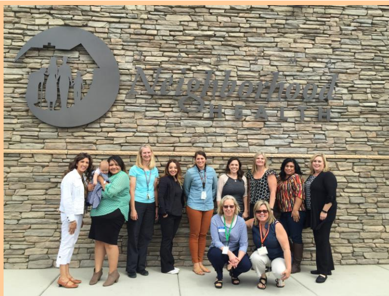
In-Person BCW Meeting May 6, 2016 | Sunnyside, WA

The Mahogany Moms Breastfeeding Coalition was reestablished in the fall of 2016. A Kick-Off Open House Meeting will be scheduled for Spring 2017 to engage the community in an action plan to develop strategies to support African American mothers and breastfeeding.